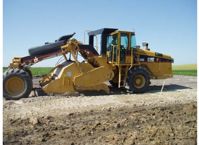
(left) Jeff Beard gets busy milling the ash into the soil

Troy and his boys are up to their ash-holes in soggy dirt over by Lake Ashtabula, ND. So instead of waiting for the wind to blow enough to dry the dirt out, they've taken to mixing water-sucking ash into the wet soil to make a solid road. They get the coal ash from the Hillsboro ACS plant and lay it out in a 1" lift or so, mill it in using a Cat RM-300 road reclaimer at about 18ft per minute, water it a little bit, then disc, blade, and pack it in. The result is a rutless road in about 3 hours. Those boys are doing all they can to help Blattner stay on schedule and we thank them for all the time they put in out there.